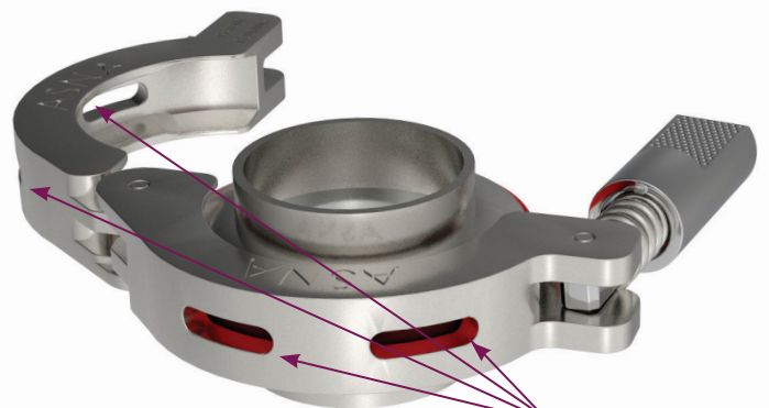
QuikVU® Windows located at both side of the clamp.